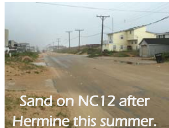
Sand on NC12 after Hermine this summer.

New maps designating Outer Banks flood zone areas are now available to see at http://fris.nc.gov/fris/ . These maps are based on much more accurate data. As a result, many Outer Banks properties in both Dare County and Currituck County are going to be in less restrictive flood zones. If you are thinking of purchasing or selling anytime soon then it is a good idea to check these preliminary maps to see if the property will be affected. Carrying flood insurance is a good idea in just about all areas of the Outer Banks. Expect these maps to be approved in 2017.