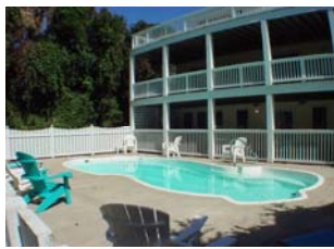
Fabulous Duck Value!